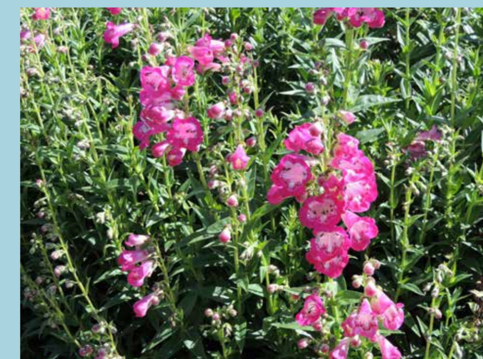
Bearded Tongue "Outstanding Plants for Alameda County"

The garden showcases plants that thrive in the local climate.